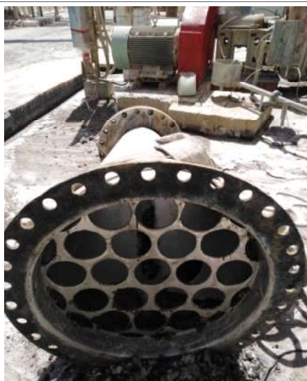
Figure 3. Installation of suction strainer to high flow slurry pump associated with 3 rd reactor

IJC uses all spare parts and consumable items from most recognized and well versed manufacturing houses without compromising on the quality. Results are being recorded by operation and noted to be satisfactory. Last 3 years, no un-expected break-down or shutdown was experienced and 100% uptime was recorded. Complete survey of storage tanks in every three years and study of its health conditions is one of its best maintenance practices.