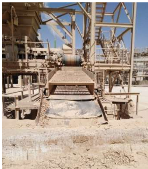
Figure 1. An image of vibrating screen on-line in rock feeding system

by installation of an on-line crusher after vibrating screens (Figure 1) but not found to be economical.