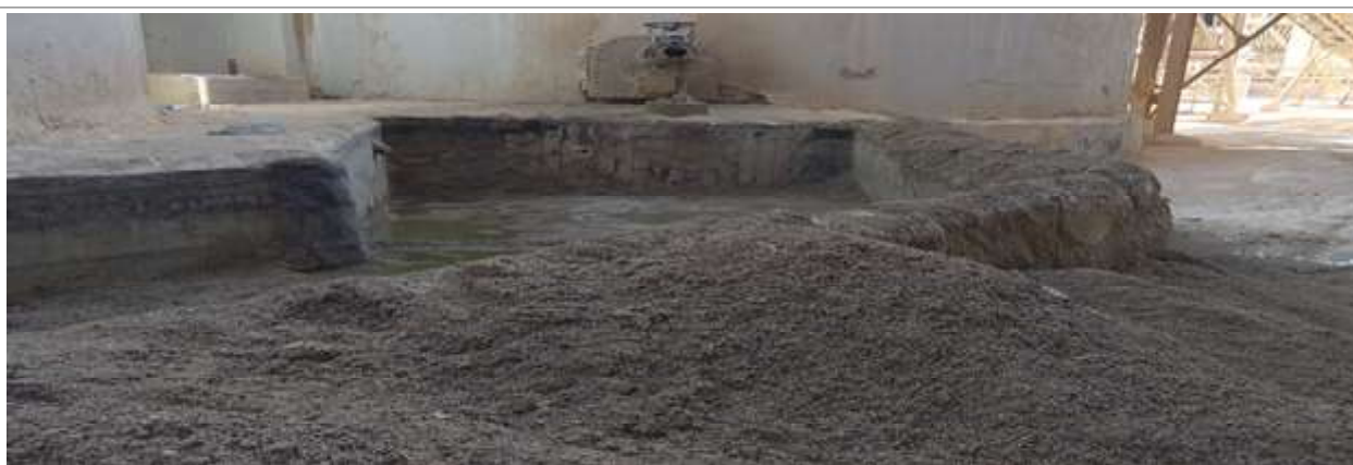
Figure 2. Reactor draining facility to remove settled heavier particles from vessels bottom

Upgradation of equipment and selection improved MOC for various parts of the equipment based on their failure rate are a cultural part of IJC's maintenance practices.